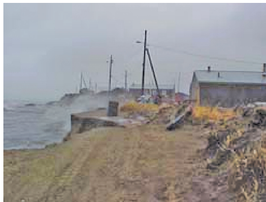
Figure 1. Shishmaref, AK. Erosion from winter storm surges required the village to be relocated.

Warming and impacts vary by location. If greenhouse gas emissions continue unabated, the continental United States is expected to warm one-third more than global averages, 2 meaning that Americans can expect an increase of 3–7°C (5.4–12.6°F), depending on where they live. For Alaska and the Arctic region as a whole, warming projections of 4–11°C (7.2–19.8°F) are at least double the mean increase for the world. 3 Already, the Arctic region is experiencing an array of impacts, including: severe winter storm surges and flooding; infrastructure damage and loss; land erosion; species loss; and the displacement of people and communities (see Figure 1). 4